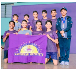
Kabaddi Competition Under 14 Boys Team 2nd Position (Selected for District Level)