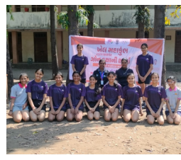
Khokho Competition Under 14 Girls Team 3rd Position