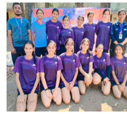
Khokho Competition Under 17 Girls Team 3rd Position (Qualified for District Level)