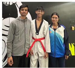
Taekwondo competition U-17 Category Meet Jain Class XI Gold medal (Qualified for state level competition)