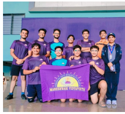
Kabaddi Competition Open age group Boys Team 3rd Position