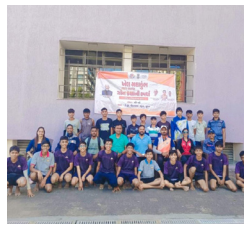
Khokho Competition Under 17 Boys Team 2nd Position (Qualified for District Level)