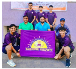
Khokho Competition Open age category Boys Team Became Champion (Qualified for District Level)